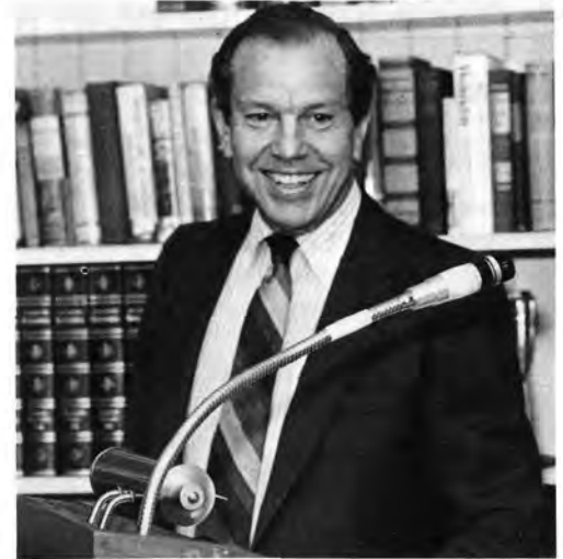
Dr. James B. Wyngaarden, NIH Director, participated in a workshop on the future direction of biomedical research.