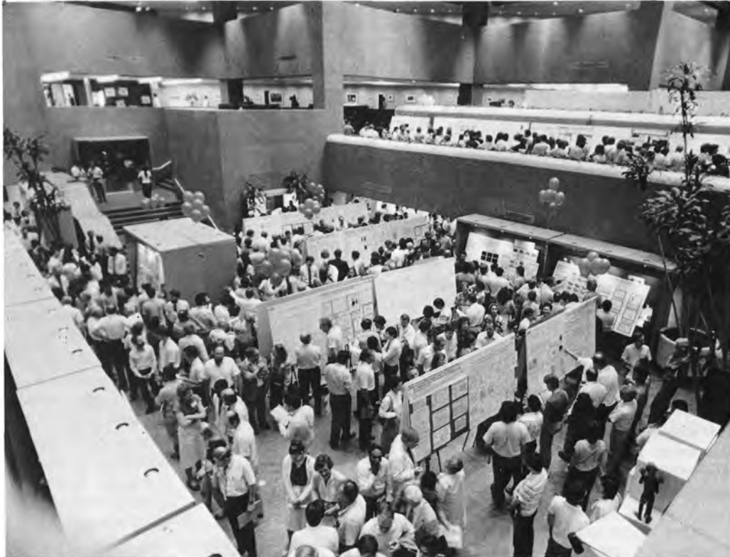
More than 3,000 persons attended NIH Research Day, held on campus Sept. 25. State-of-the-art research was discussed among scientists from diverse disciplines through symposia, poster sessions and workshops.