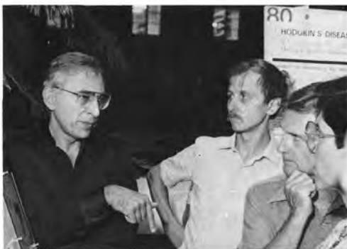
Dr. Robert Gallo, NCI, discusses his poster with many interested onlookers.